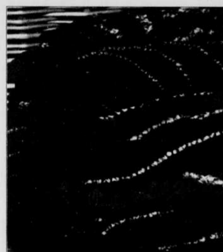
—Shibori, wrapped, stitched & dyed

This class explores the traditional Japanese art of Shibori fabric design through resist dyeing. Students will learn basic stitches and knots, then use them in combination with various materials and dyes for both smooth and textured surface effects. Share the excitement when removing the stitches and knots to expose exquisite patterns and the unexpected surprises this ancient art can produce. Some materials provided. Additional scarves available for purchase. 12 hours of instruction. Membership required. Sun, Jan 26-Feb 9 12:30-5:00pm #43 members $46