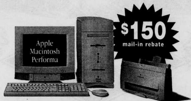
Macintosh Performa 6400 series, Apple Multiple Scan 14 inch Display, Apple Color StyleWriter 2500