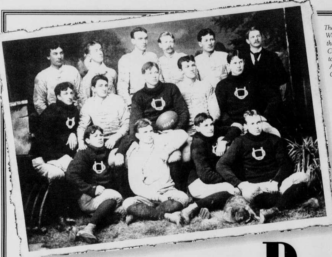
The 1894 Webfoots lost the first ever Civil War to the Oregon Agriculture College, 16-0.

The Emerald takes a look back at three of the most memorable Civil War games