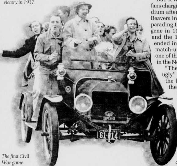
The first Civil War game was played in 1905 at Kincaid Field, which is now the site Gilbert Hall.

B eaver football players physically pummeling Oregon fans, a riot between students from Oregon and Oregon State and a game featuring 11 turnovers are all a part of the 102-year history of the Civil War.