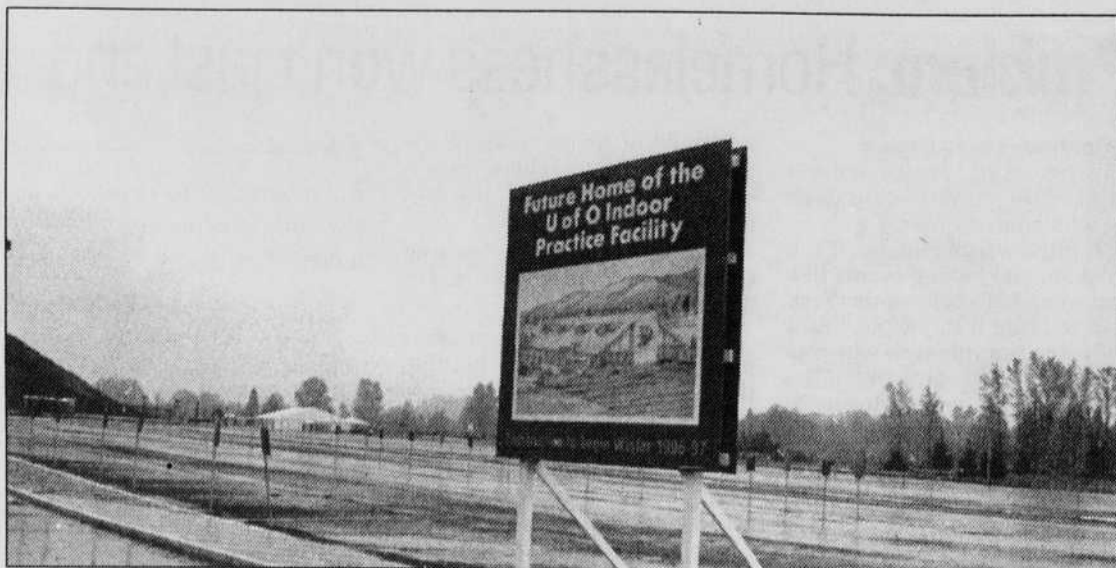
The Athletic Department's plans for a new indoor practice facility and outdoor practice fields has some Eugene residents worried about future parking shortages.

Help our successful recycling program on campus by putting the Oregon Daily Emerald back in its original rack when you've finished reading it. This will allow another person to read it and/or be easily picked up for recycling.