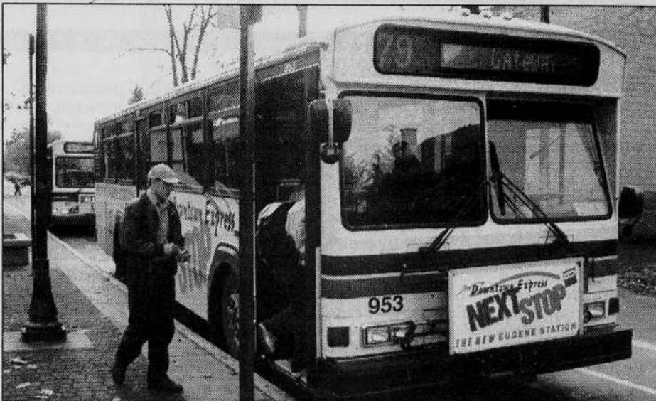
Students board a LTD bus running the No. 79 route at the University North Station. This winter, hand-scanners may be used to check for people using fake student IDs.

Random spot checks on the routes will begin during winter term and are designed to catch people using fraudulent cards.