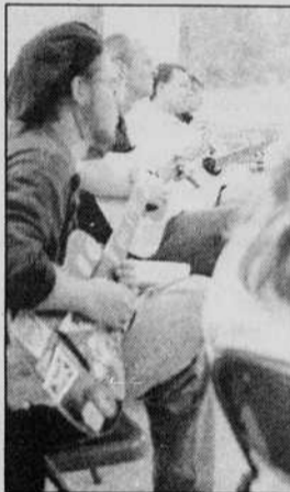
Turn to MUSIC , Page 10