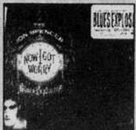
#1 Now I Got Worry, The John Spencer Blues Explosion

The 10 albums on 88.1, KWVA, as determined by DJ airplay for the week beginning 10/11.