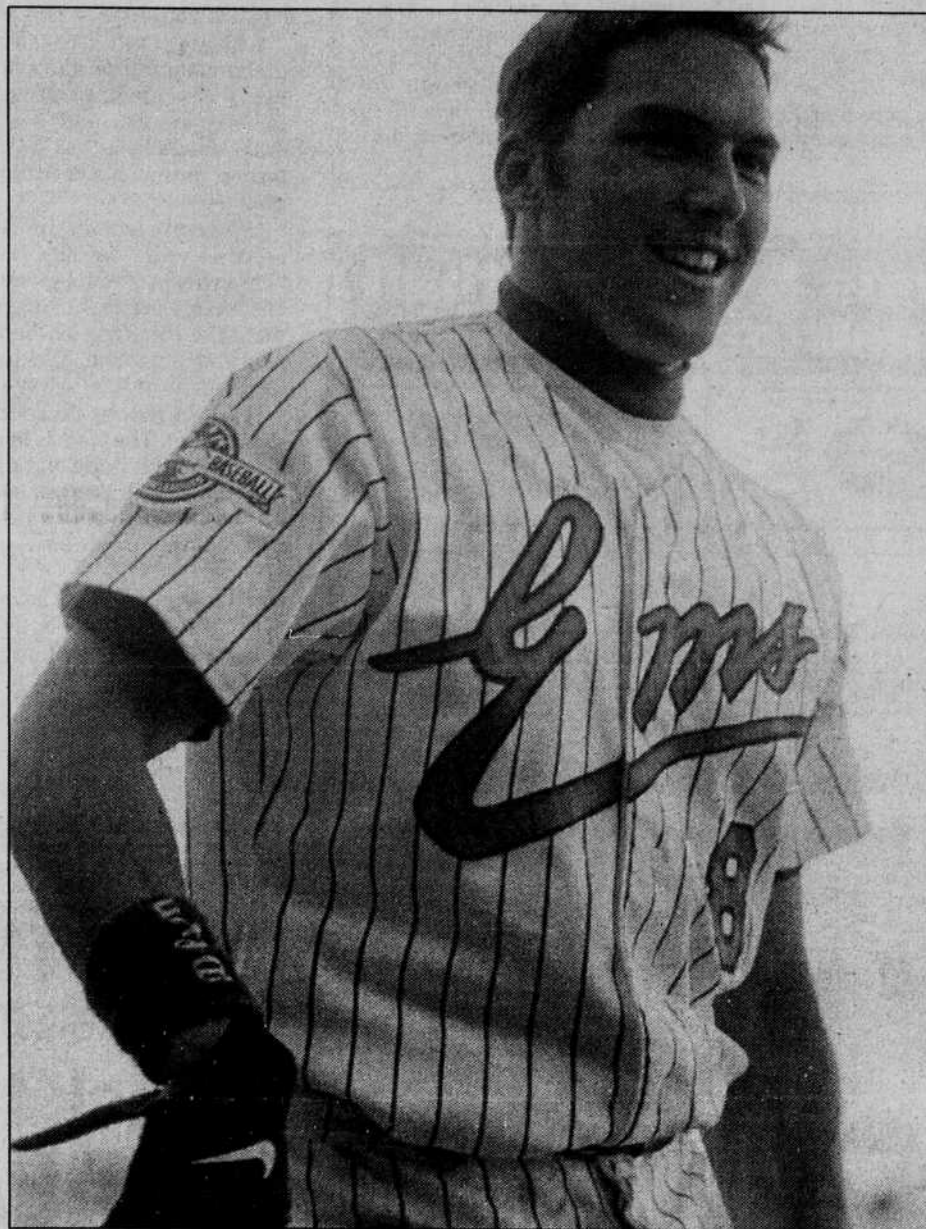
Emeralds' shortstop Mark DeRosa left his life of being a two-sport star at an Ivy League university to come to Eugene and live out his dream of playing major league baseball.