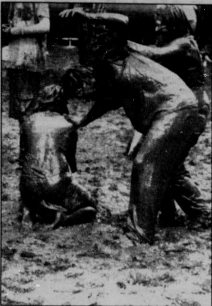
Covered in mud and listening to the music, several folk music fans at the Willamette Valley Folk Festival wrestle in mud caused by heavy rains Saturday evening. The event lasted through Sunday.