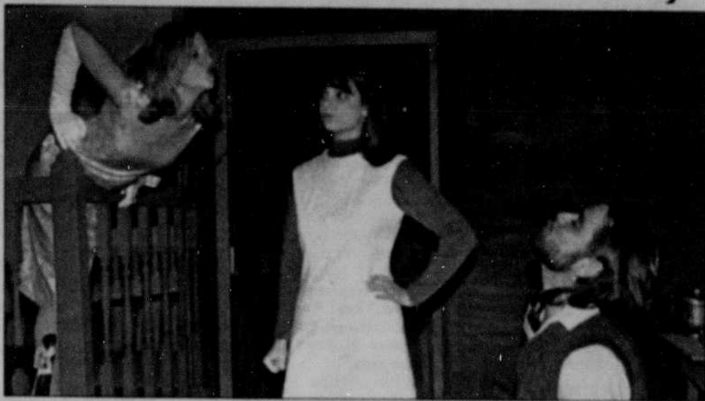
Black Comedy begins March 6 at 8 p.m. in the Arena Theatre. Student tickets are $3.