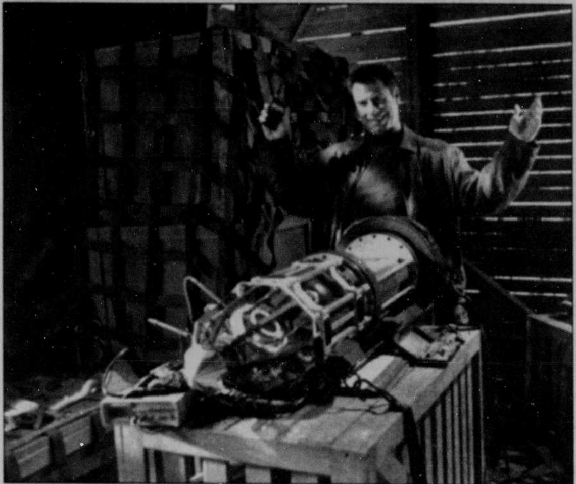
John Travolta plays a stealth bomber pilot in charge of transporting two nuclear warheads on a test run.