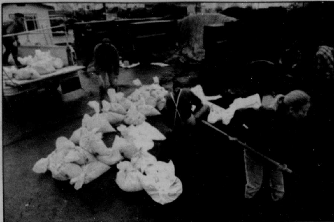
Local residents help fill sand bags for people to use, trying to protect their homes from flooding.

The Lane County sheriff's department Wednesday night was strongly advising people to