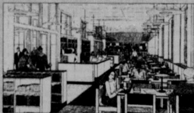
Proposed Reading Room, looking south.

Drawings by Boucher, Mouchka, Larson Architects