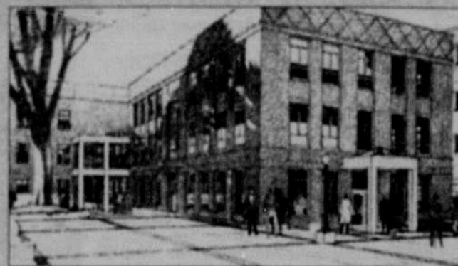
East Wing looking west, with proposed entrances.

The School of Journalism and Communication is planning on renovating Allen Hall, with new entrances and a new reading room in the basement, which was recently vacated by University printing and mailing services.