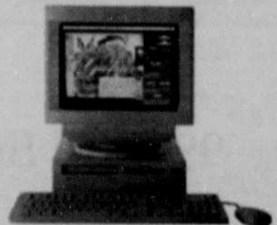
Macintosh Performa® 6214CD 75 MHz PowerPC 603, 8MB RAM/1GB hard drive, CD-ROM drive, keyboard, mouse (monitor available separately) and all the software you're likely to need.