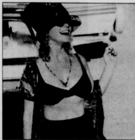
One of Jerry's kids.