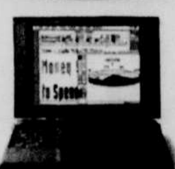
PowerBook 5300/100 8MB RAM/500MB hard drive, PowerPC 603 processor

Being a student is hard. So we've made buying a Macintosh® easy. So easy, in fact, that prices on Macintosh personal computers are now even lower than their already low student prices. And with the Apple® Computer Loan and 90-Day