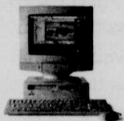
Macintosh Performa 631CD 8MB RAM/500MB hard drive, CD-ROM drive, 14" color monitor, 14.4 modem, keyboard, mouse and all the software you're likely to need.