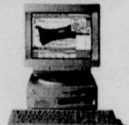
Power Macintosh 7100/80 w/CD 8MB RAM/700MB hard drive, PowerPC 601 processor, CD-ROM drive, 15" color monitor, keyboard and mouse.