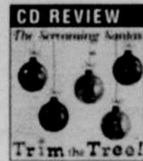
CD REVIEW Trim the Tree Screaming Santas

One revealing passage comes in the chorus, when we discover one reason the songwriter seems to love the holiday. In his words: "It feeds my inse-