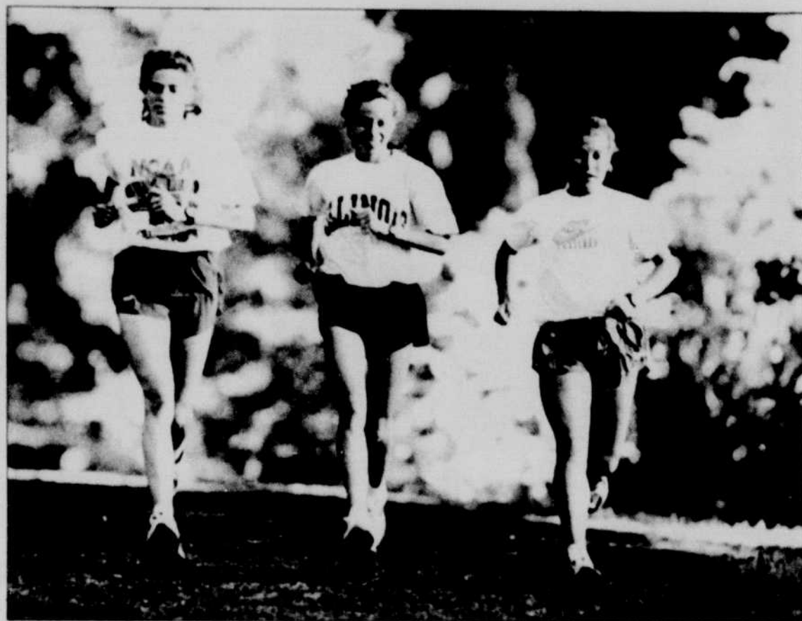
The Oregon women's cross country team gets a rematch against Washington in their only home meet of the season, the Jeff Drenth Memorial.