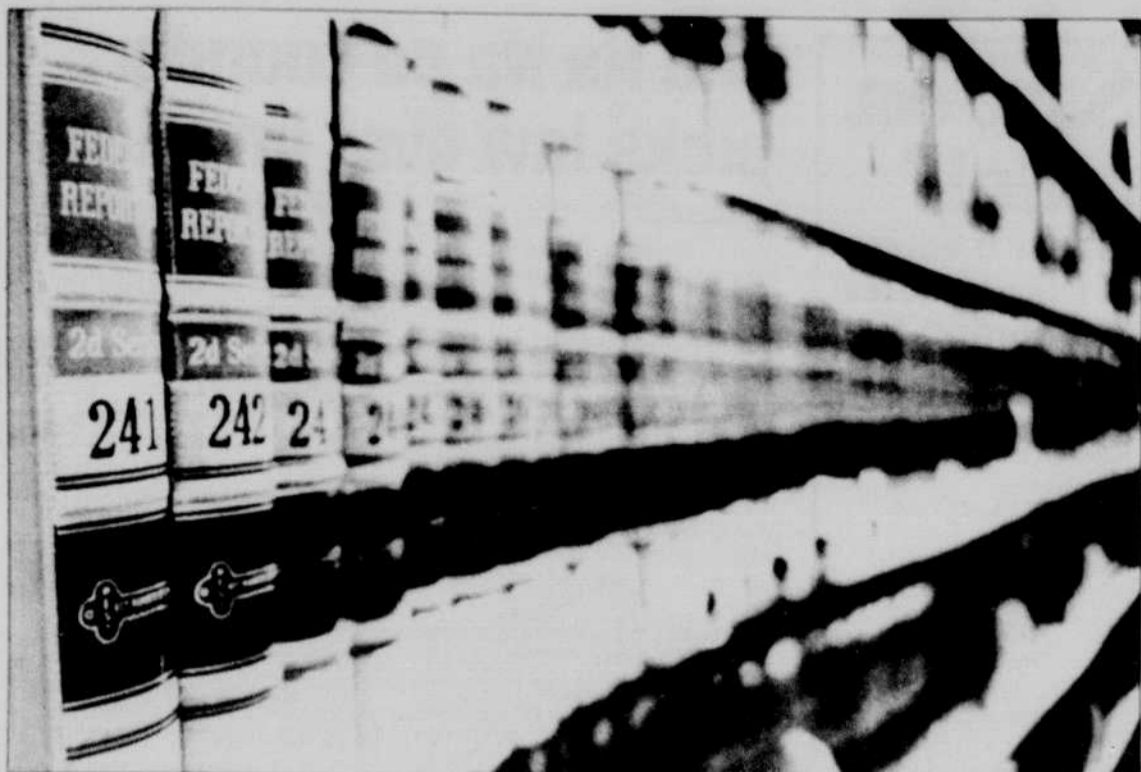
The University Law Library is packed with so many books like these that 50,000 volumes have to be stored across campus in the Knight Library. Students who want those books must request and wait for them.