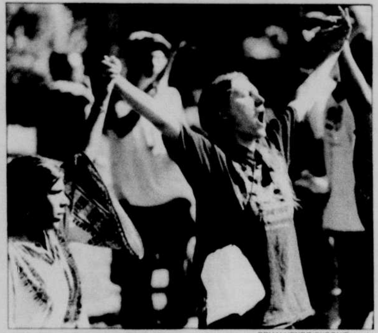
As the crowd at Skinner Butte Park grew, young and old gathered in a circle of hundreds of people, all holding hands and singing.