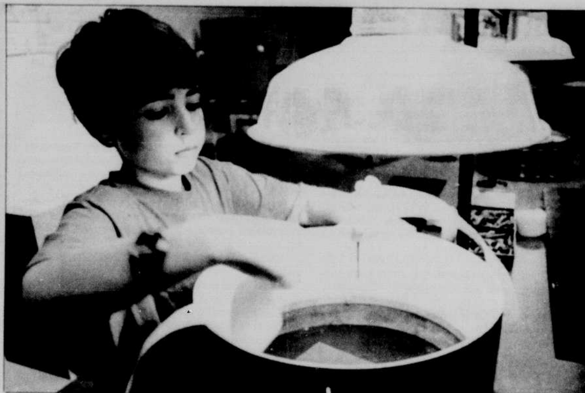
A middle school student works on his science project Wednesday afternoon at the Willamette Science and Technology Center.