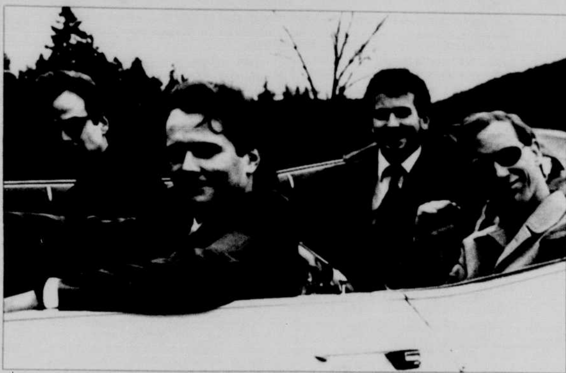
The Revelators sing the blues this weekend at Good Times while they celebrate their first CD release.