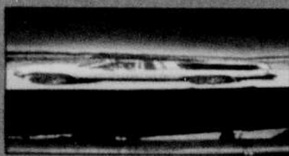
Todd Norby, Oregon State U. "Reflections on a surf trip to California."