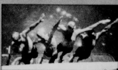
Lawson Knight, Oregon State U. "Showerin' at Shasta Lake."