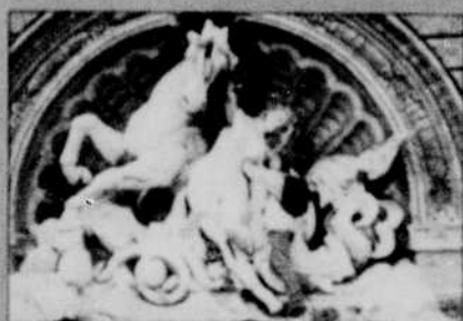
Christian Favalli, Vanderbilt U. "Hands-on study of Italian art history: Traversing Italian cities in search of naked chicks."