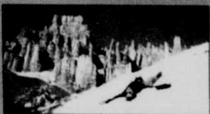
Beth Poldoro, Portland State U. "Kickin' It in Bryce Canyon National Park."