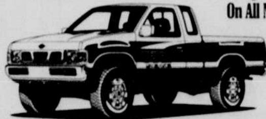
4x4 SE V6 King Cab with Optional Value Truck Package

College Grad Program Available On All New Nissans.