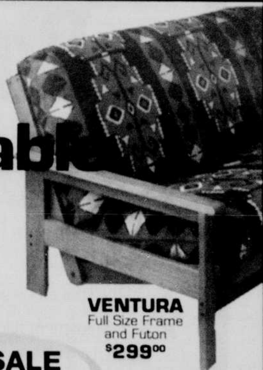
VENTURA Full Size Frame and Futon $299 00