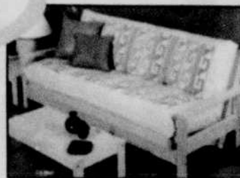
CALGARY Unfinished Pine Full Size Frame $149 00