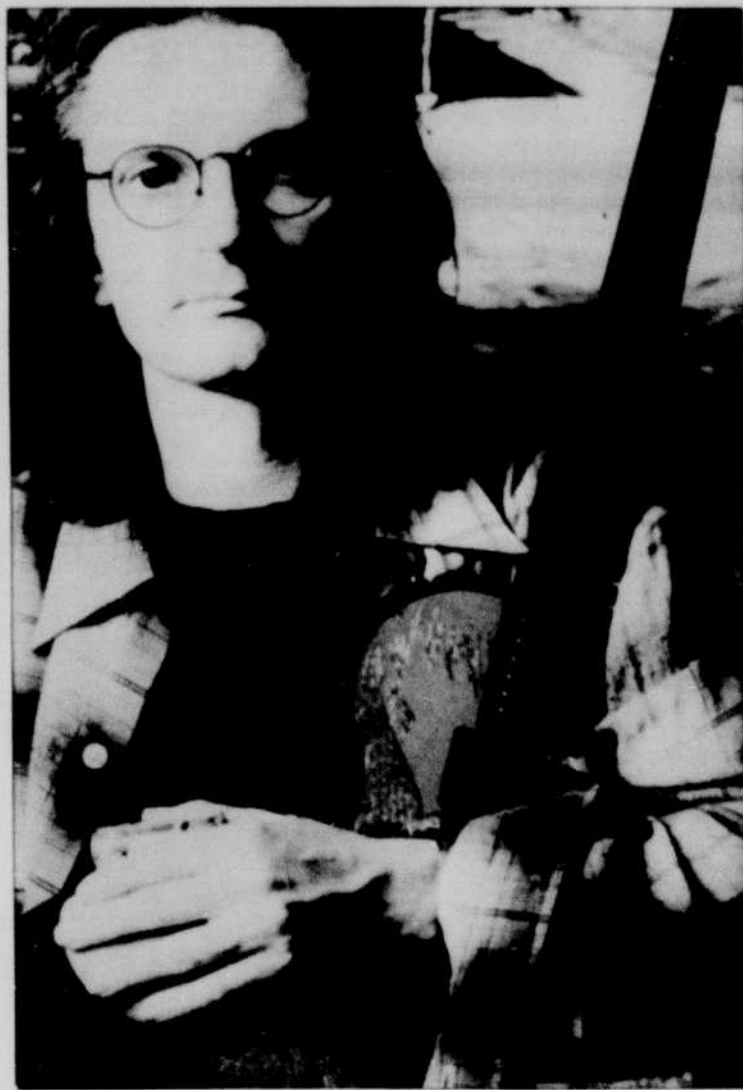
Sonny Landreth will play rock at Good Times Monday at 9:45 p.m.

Sonny Landreth, rock 9:45 p.m. at Good Times Admission is $5