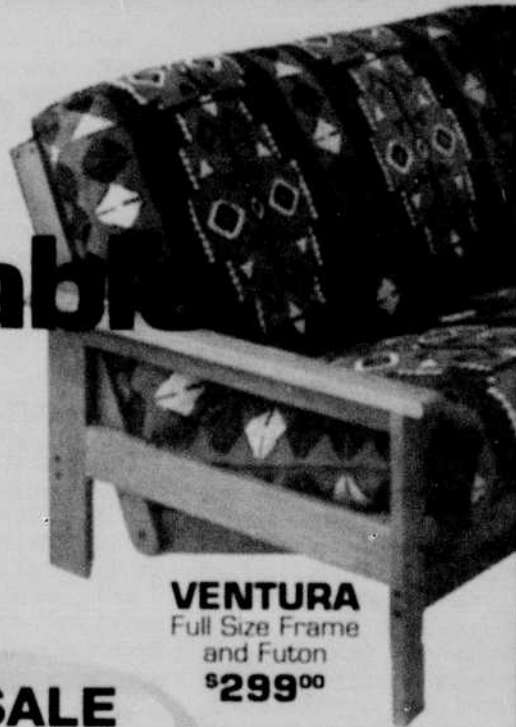
VENTURA Full Size Frame and Futon $299 00