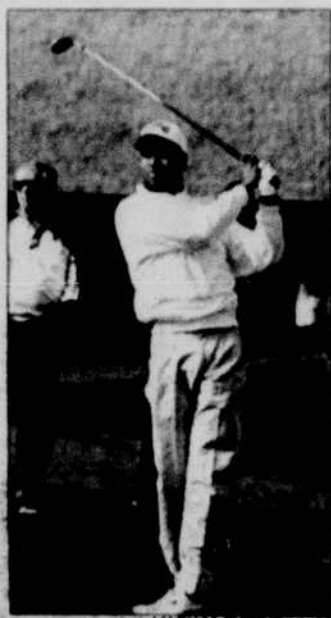
Tiger Woods will get his shot in today's Masters.

He then hit dozens of shots on the practice range before taking part in the par-3 tournament, where he struggled to a 2-over-par 29.