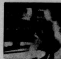
World of Noise Everclear

As for the rest of World of Noise , I definitely think it's worth