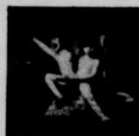
Balance Van Halen

The attitude is weak, but the sound is great. Looking at the back cover photo of the album, you can't tell if this is really Van Halen or