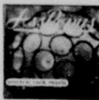
Electric Rock Music Ass Ponys

Electric Rock Music is Ass Ponys' major label debut and when asked how the band might change to stay within the mold of the major label