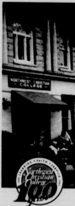
Northwest Christian College, established in 1895, is regionally accredited by the Northwest Association of Schools and Colleges