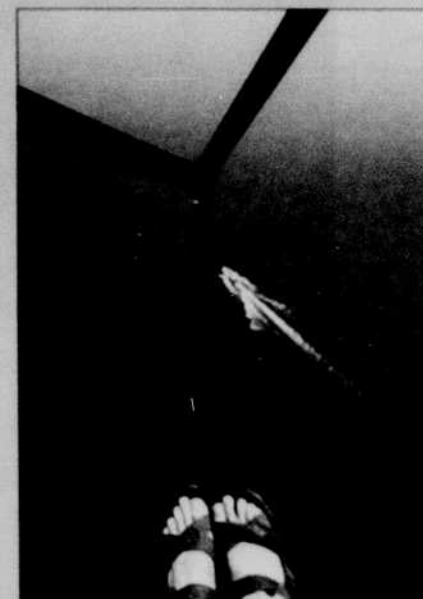
Chris O'Connell, Iowa State U. "Catching serious air without wheels parasailing 500 feet above Lake Tahoe."