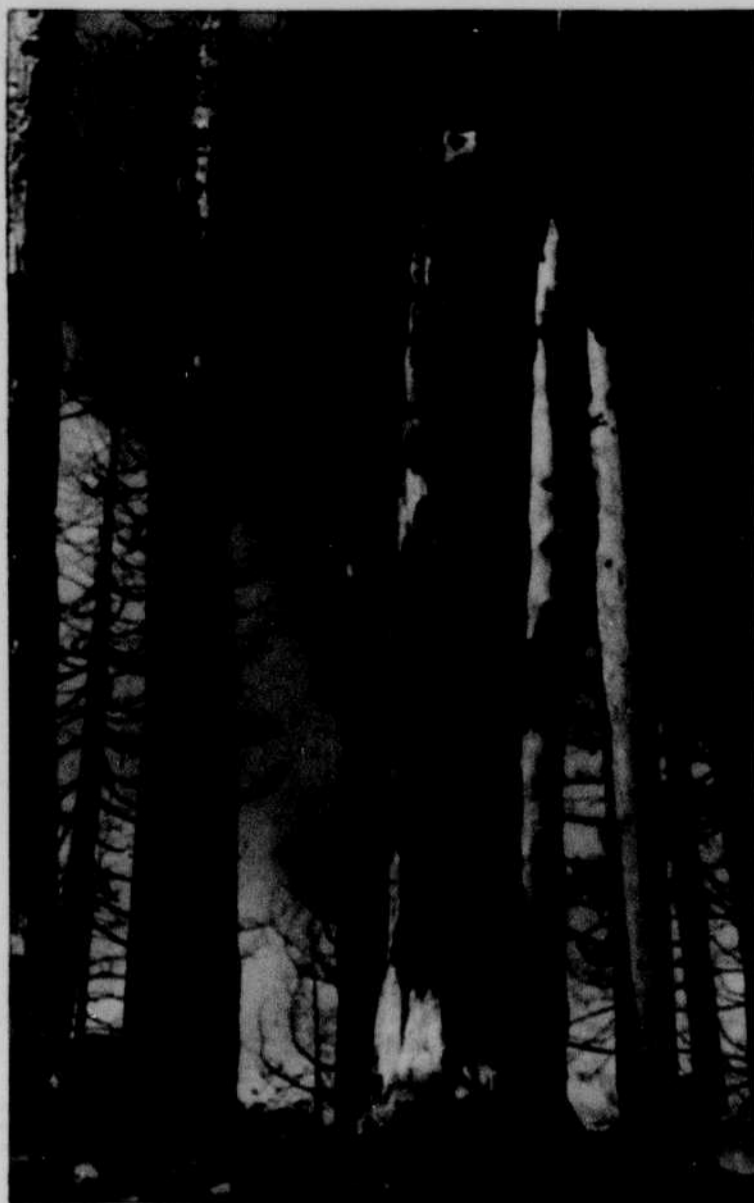
Conservation activists will show their documentary film Born in Fire: Warner Creek and the Politics of Salvage Logging tonight at 7:30. The film will introduce the audience to the Warner Creek forest land.

The free presentation is sponsored by the Outdoor Program.