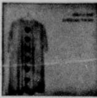
American Thighs Veruca Salt

Remember the good old days when rock stars were supernatural gods who commanded respect through their sacrificial lives as martyrs for a generation. Fans held a deep respect for fire-breathing, heroin-injecting and Jack Daniels'-drinking bands that seemingly gave up their lives and their health to please the masses with monstrous rhythms that filled arena's