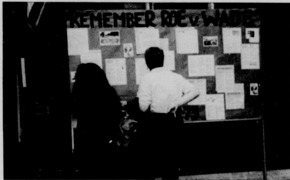
Supporters of abortion rights placed a bulletin board with information about the history of Roe vs. Wade in the EMU Monday. Sunday was the 22nd anniversary of the Supreme Court decision in the Roe vs. Wade case.

Several of the 15 or so people at the celebration said that using violence is a des-