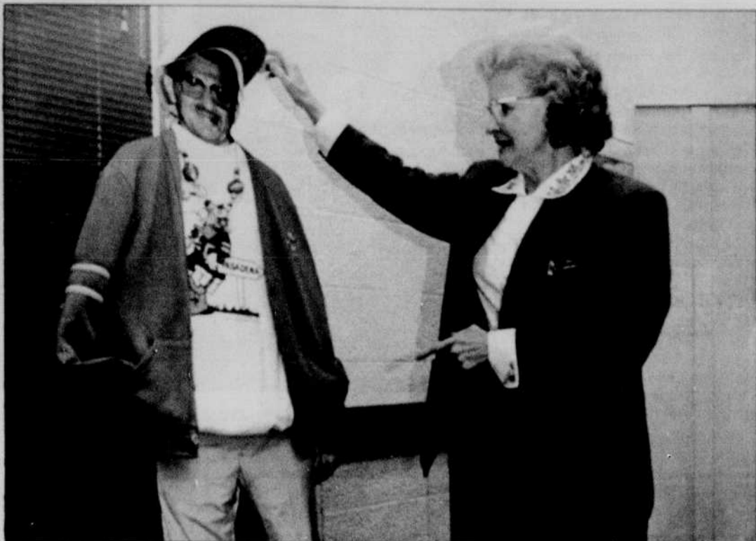
Eugene Mayor Ruth Bascom dresses poster of Penn State coach Joe Paterno in Duck gear at a City Council meeting Wednesday.