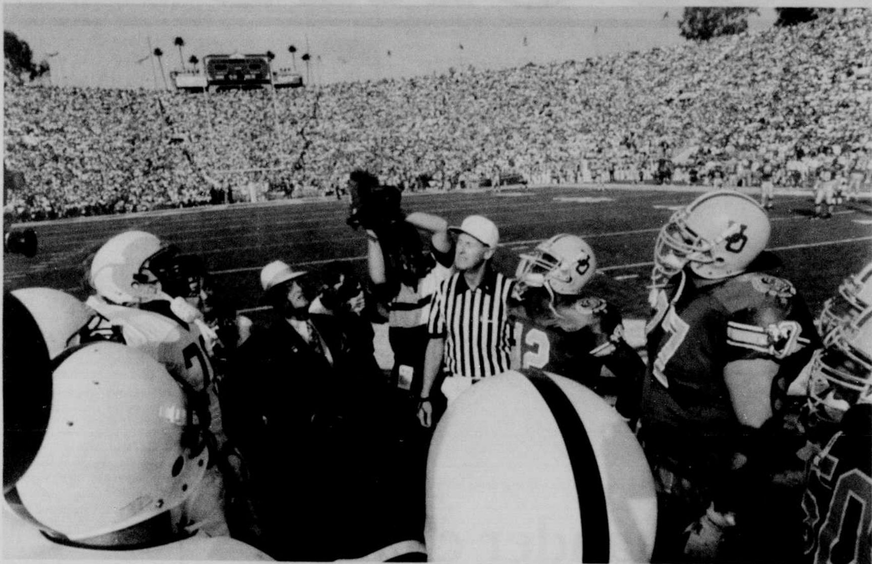
Even the coin toss was a big event at the 81st Rose Bowl as golfer Chi Chi Rodriguez was on hand for the ceremonies.