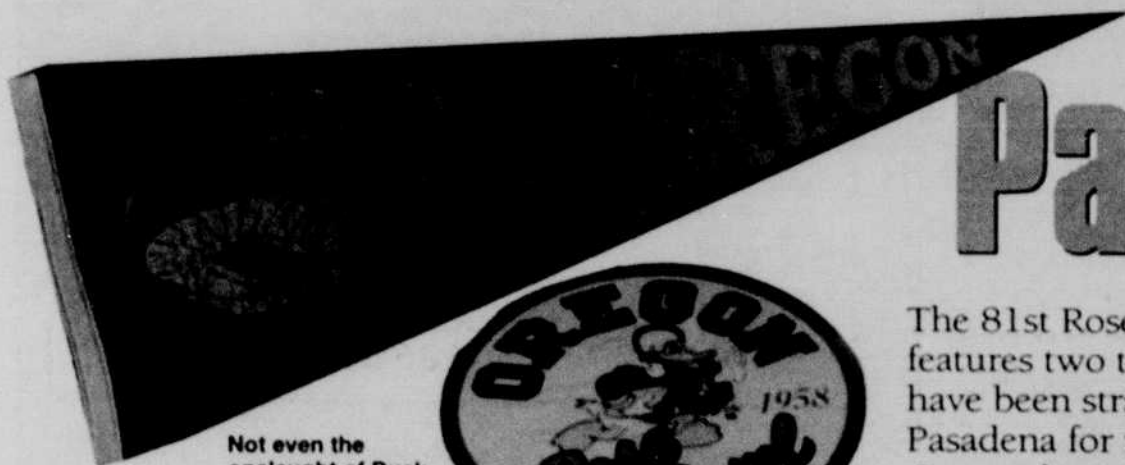
Not even the onslaught of Duck merchandise could help the Ducks beat the Buckeyes.