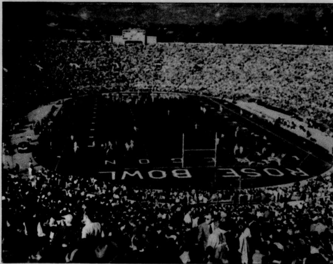
The Rose Bowl was jam-packed in 1958 as the heavily favored Ohio State Buckeyes took on Oregon.