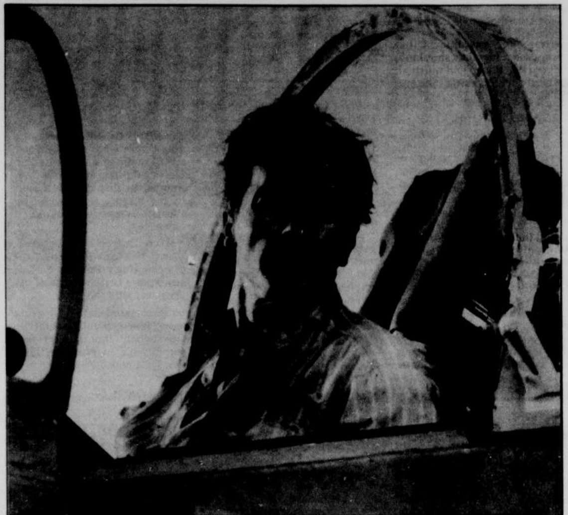
True Lies, the No. 1 movie at the in the country, is Arnold Schwarzenegger's revenge on all of his critics after last year's critically disastrous Last Action Hero, which incidentally placed 12th for 1993.