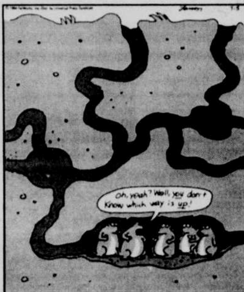
The ultimate gopher insult