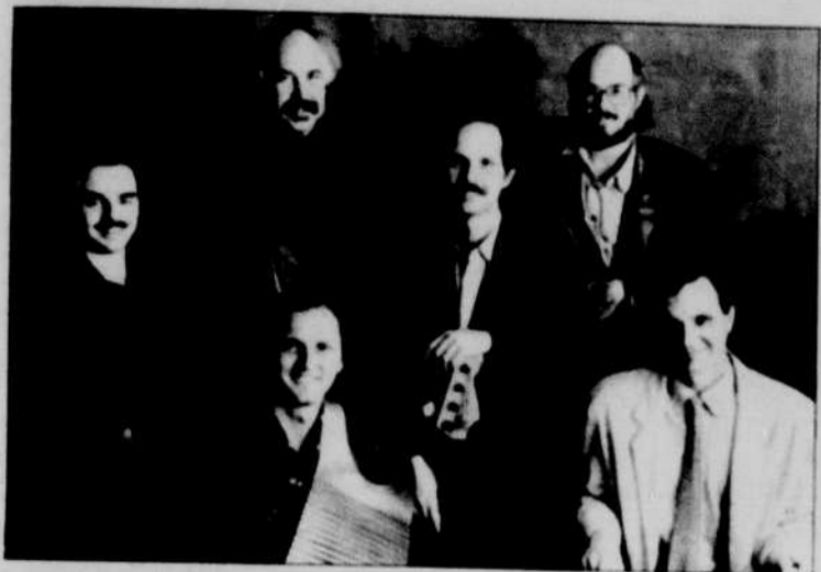
Beausoleil is one of the many groups playing at the Cuthbert Amphitheater this summer.