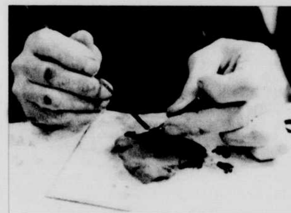
Max carving wax for lost wax casting

Tues, June 28-Aug 9 6:00-9:00pm PLU 24 members $45