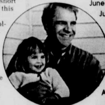
Steve Martin stars as Michael McCann, a man dedicated to raising his adopted daughter in a loving home in A Simple Twist of Fate .