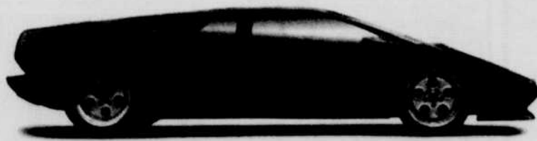
Lamborghini Diablo VT with leather interior, cool wheels and a really, really, really fast engine.

One of these high-speed, high-performance machines can be yours for low monthly payments. The other one is just here for looks.