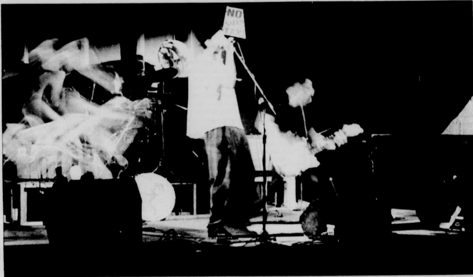
Lincoln Brigade, who had been scouting mostly independent labels, has found that even though public opinion seems to frown on major label contracts, it is quite happy with its seven-record contract from Island Records.