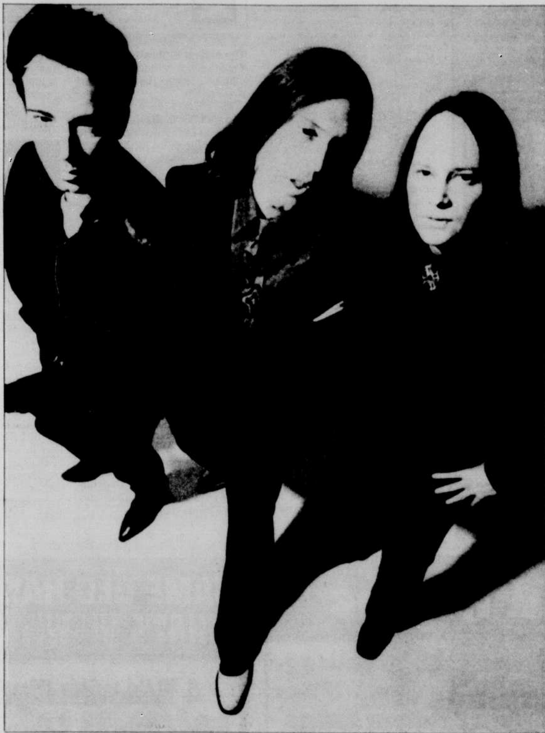
Urge Overkill brings their funky brand of entertainment to the EMU Ballroom Monday.