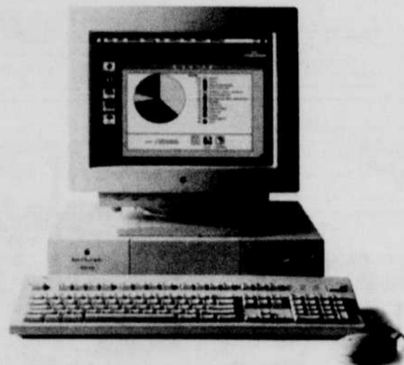
Power Macintosh 6000/60 8/160 with an Apple Color Plus 14" Display, an Apple Extended Keyboard II and mouse.

Right now, when you qualify for the Apple Computer Loan, you could pay as little as $33* a month for a Power Macintosh. It's one of the fastest, most powerful personal computers ever. Which means you'll have the ability to run high-performance programs like statistical analysis, simulations, video editing and much more. Without wasting time. If you'd like further information on Power Macintosh, visit your Apple Campus Reseller. You're sure to find a dream machine that's well within your budget.