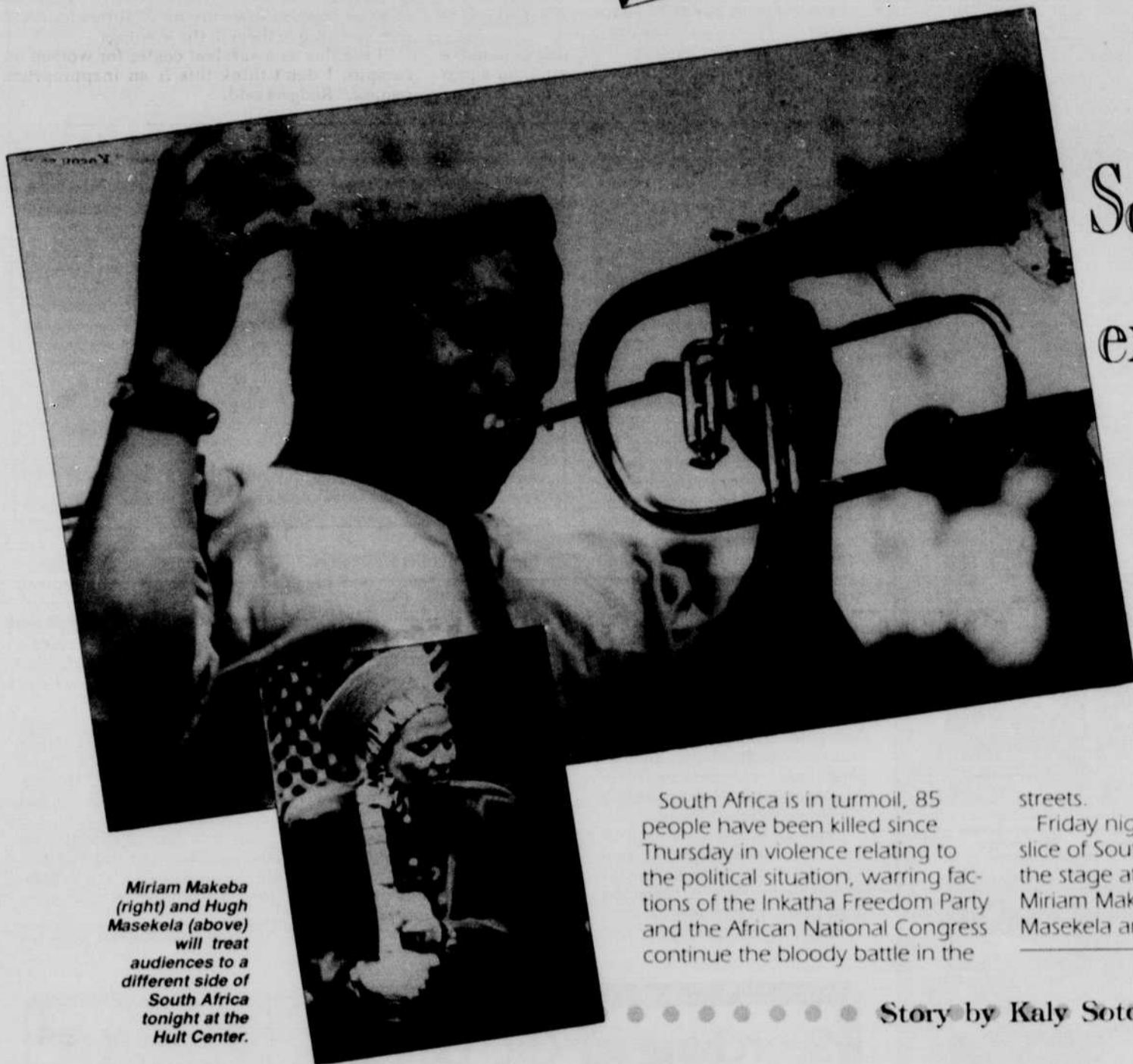
Miriam Makeba (right) and Hugh Masekela (above) will treat audiences to a different side of South Africa tonight at the Hult Center.