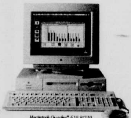
Macintosh® Quadra® 610 8/230, internal AppleCD™ 300x CD-ROM Drive, Apple® Color Plus 14" Display, Apple® Extended Keyboard II and mouse. Only $2,397.00.