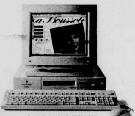
Power Macintosh™ 6100/60 8/250, internal AppleCD™ 300x Plus CD-ROM Drive, Macintosh® Color Display, Apple® Extended Keyboard II and mouse. Only $2,633.00.

Giving people more value for their money has made Macintosh® the best-selling personal computer on campuses and across the country for the past two years. And that's a trend that is likely to continue. Because there are Macintosh and PowerBook® models