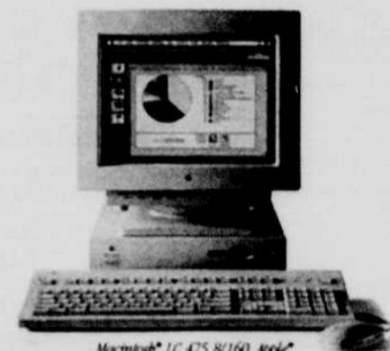
Macintosh® LC 475 8/160, Apple® Color Plus 14" Display, Apple® Extended Keyboard II and mouse. Only $1,645.00.

The dictionary has at least three definitions for "value." So do we.