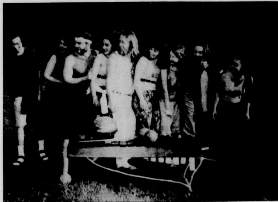
What are the members of Kudana looking for? If you really want to know come to WOW Hall Friday night in costume and find out. Donations are encouraged.

Tonight's performance will begin at 8:30. Donations are requested on a sliding scale from $5 to $7. If you would like more information, call 484-9884.