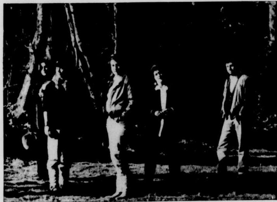
Equinox will make their debut at the April Fool's Ball. This all womyn's group will perform some great originals and some rockin' covers in their program.